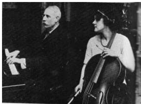
(Harrison with Elgar - rehearsing concerto)

Beatrice Harrison also gave the first performance of Edward Elgar's Cello Concerto outside London, at the Three Choirs Festival in Hereford in 1921. By 1924 she had toured in Europe and America, and in November 1925 she reappeared with the Royal Philharmonic in an all-Elgar concert, performing the Cello Concerto under Elgar's baton (he had insisted that she be the soloist whenever he conducted the work). A year or two later, Beatrice Harrison was the soloist chosen to make the 'official' HMV recording of the concerto with Elgar conducting. She also gave the first radio performance of the Elgar concerto, needless-to-say with the composer conducting.