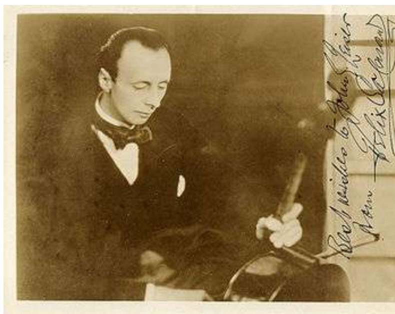
A signed photograph of Salmond looking at his cello, c. 1922

the final performance was a little short of disastrous, receiving scathing reviews like "the orchestra made a public exhibition of its miserable self." To be fair, one should point out that Elgar did not blame the musicians – he even wrote to thank the musicians for their participation. Needless to say, the concerto made virtually no impression on the audience. Elgar later said that if it weren't for Salmond's diligent work in preparing the work, he would have taken it off the concert entirely. However, all this was to have a heavy, and bitter, future toll for Salmond. He simply lost faith with the British musical system.